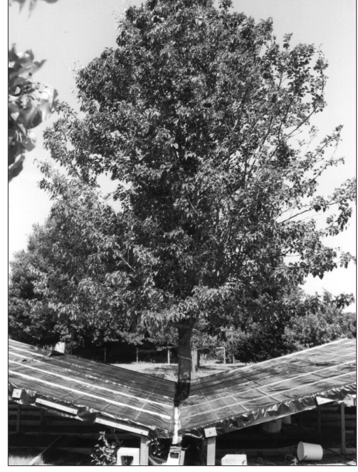
Using unique field apparatus, scientists were able to study what happens to rainwater as it is intercepted by urban trees.

i-Tree Vue uses national land cover data maps to assess a community's land cover, including tree canopy, and some of the ecosystem services provided by the existing urban forest. The effects of different planting scenarios on future benefits can also be modeled.