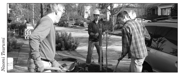
Through partnerships with Friends of Trees and volunteers, street trees are being planted to help with stormwater management in Portland, Oregon. The results of using incentives for homeowners exceeded expectations with more than 1,000 new yard trees planted in the first years of the 'Grey to Green' initiative.