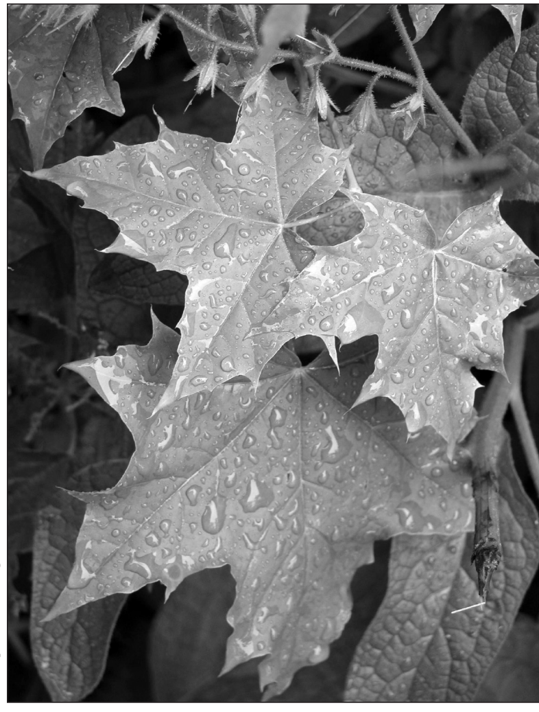
Drop by drop, rainwater is stored on the leaves of trees, slowing and reducing runoff. The collective effect of this simple action can make a huge difference in a community.

Trees in our communities provide many services beyond the inherent beauty they lend to streets and properties. One of the most overlooked and underappreciated is their ability to reduce the volume of water rushing through gutters and pipes following a storm. This means less investment in expensive infrastructure and – importantly – cleaner water when the runoff reaches rivers and lakes.