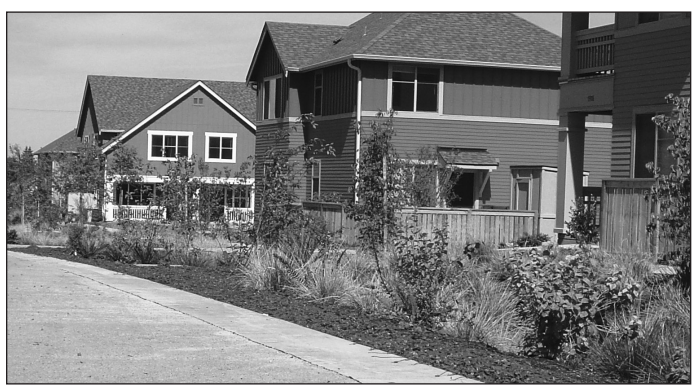
A streetside swale can be attractive as well as useful in retaining and cleaning stormwater runoff.

offer the welcome cooling effect of shade in the summer. A swale with only rock or sod is depriving the neighborhood of a full return on its investment.