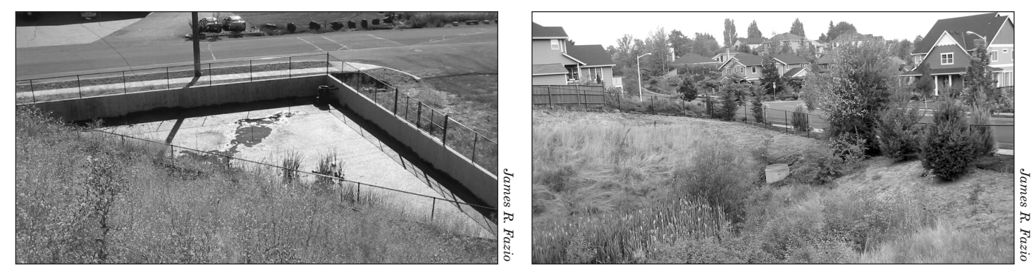
Community policy can make the difference between ugly, single-use stormwater basins and those that provide not only function but open space, a refuge for wildlife, and a touch of beauty.

- From: Portland Stormwater Management Manual