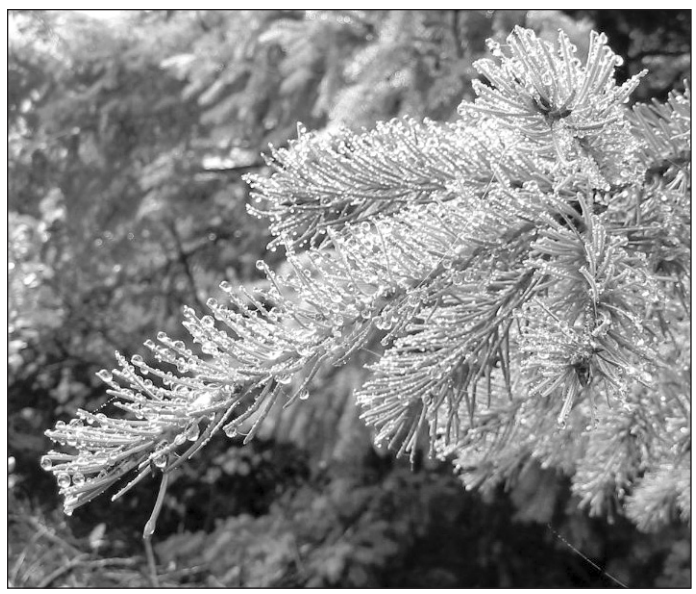
Conifers have even more rainwater interception potential than deciduous broadleaf trees, but both can have a significant impact on the volume and purity of storm runoff.

Due to the technical nature of much of the material in this issue, its thorough treatment is well beyond the page limits of a bulletin. To find links and other sources that will provide more details, please visit arborday.org/bulletins and click on No. 55.