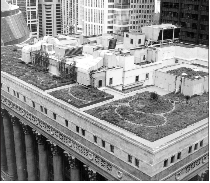
Trees, shrubs and other vegetation atop the city hall building in Chicago help slow and retain stormwater runoff as well as reduce the urban heat island effect. The site has served as a demonstration of what can be done with beneficial results elsewhere in the city.

Milwaukee – City funding is paying off in reduced runoff and improved water quality through downspout disconnects and several greening programs.